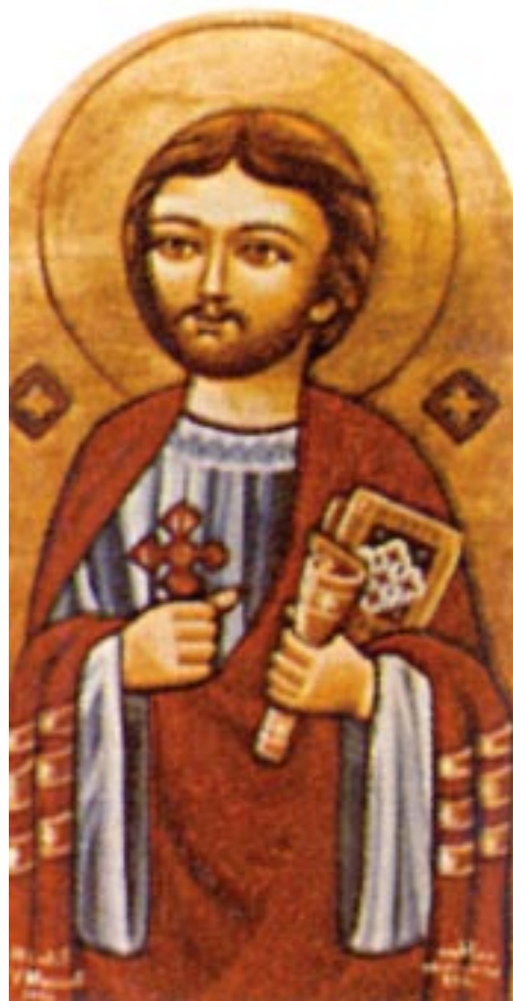
St. John the Beloved