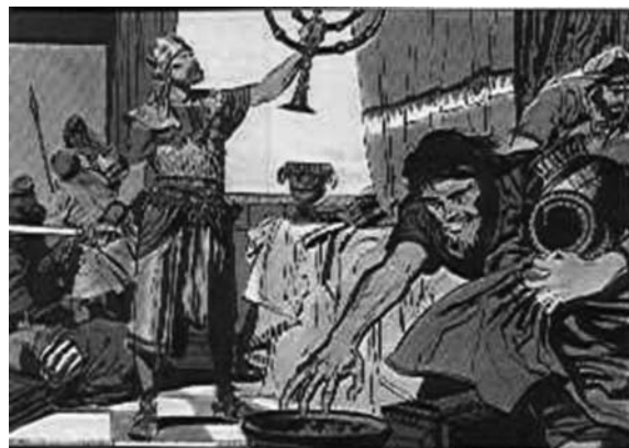
Maccabees desecrates the Temple

I Maccabees was written about 100 B.C. in the Hebrew language and while the author is unknown, he was most likely a Palestinian Jew very learned in the traditions and writings of Judaism. His aim in writing was to reveal how God had saved his people Israel through the family of Mattathias and his three sons, Judas, Jonathan and Simon and also through his grandson, John Hyrcanus. He also expresses the doctrine of Israel’s loyalty to God and their worship exclusively of Him and their obedience to His commandments. He goes on to condemn, not the Seleucid kings trying to wipe out Judaism, but most of