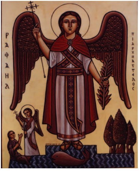
"Tobias and the Angel," represents God being nearer to us than we think. God is ready to assist us if we remain faithful to Him.

Written in Aramaic, the original Holy Book of Tobit was lost for centuries. The Greek translation, existing in three different recensions', is our primary source. In 1955, fragments of the Holy Book in Aramaic and in Hebrew were recovered from Cave IV at Qumran. These texts are in substantial agreement with the Greek recension that has served as the basis for the present translation. This Holy